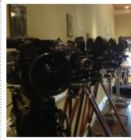
At \ the \ ASC, \ after \ an \ event

"Editing is like a puzzle. Eventually every piece of footage fits perfectly into an artistic montage of scenes and sounds."